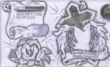
Prisoner Art Work on an Envelope to IPM